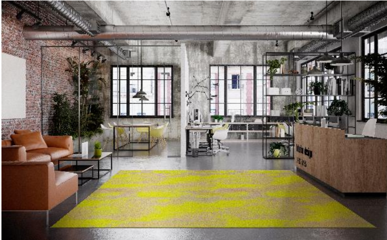
ID FORUM "KIMI"