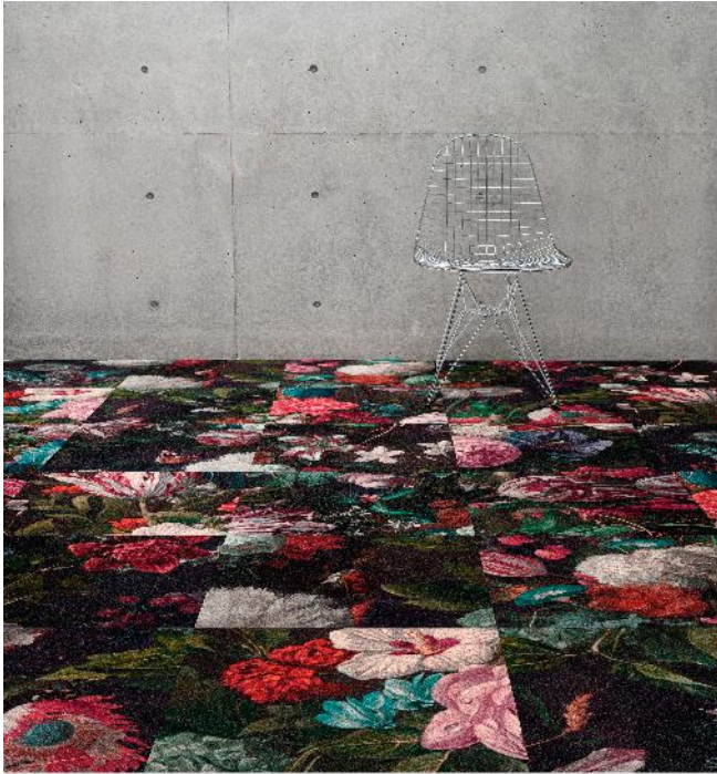
ID FORUM "SOFIA"