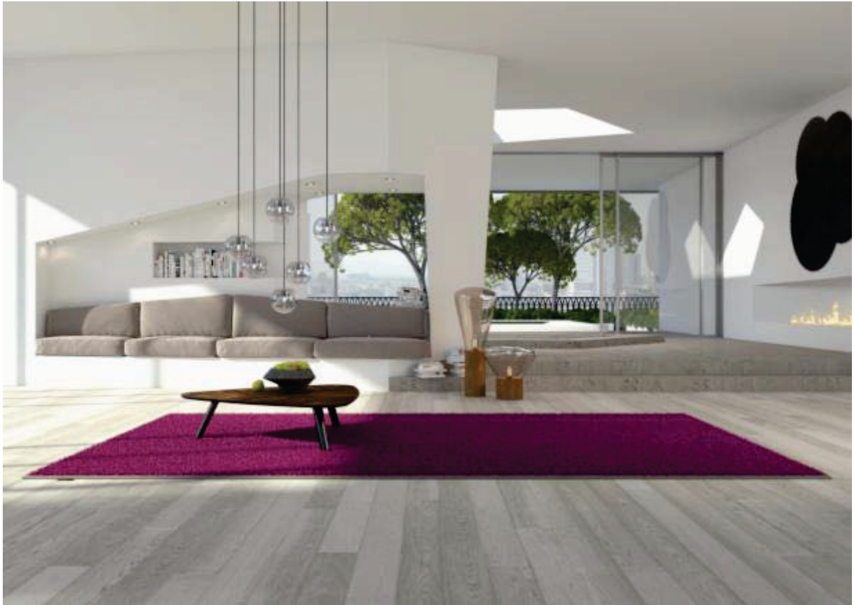
POODLE 1492, thin leather edge, rectangle, loft environment