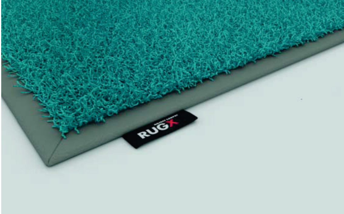
POODLE smeralda 1495, narrow leather edge L 1822, rectangle