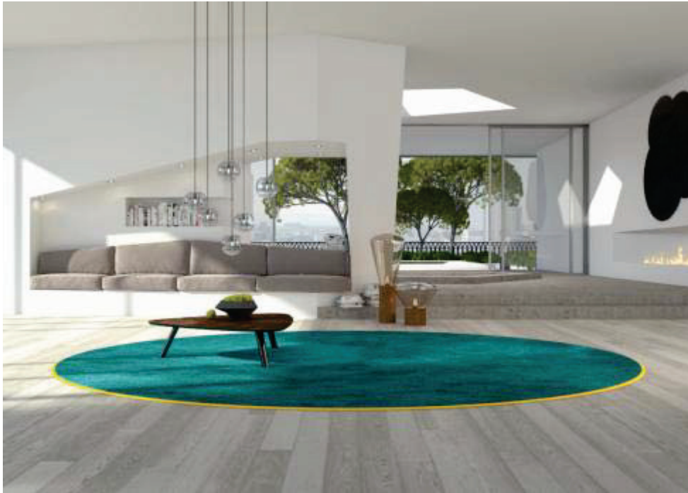
SILKY SEAL 1232, thin leather edge, circle, loft environment