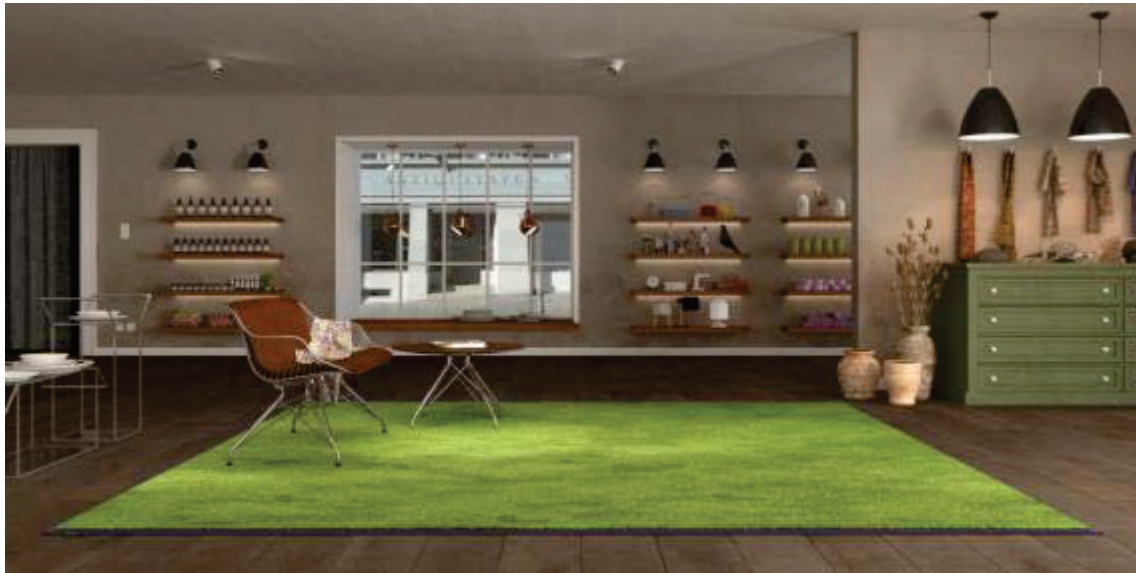
SILKY SEAL kermit 1227, thin leather edge, square, shop environment