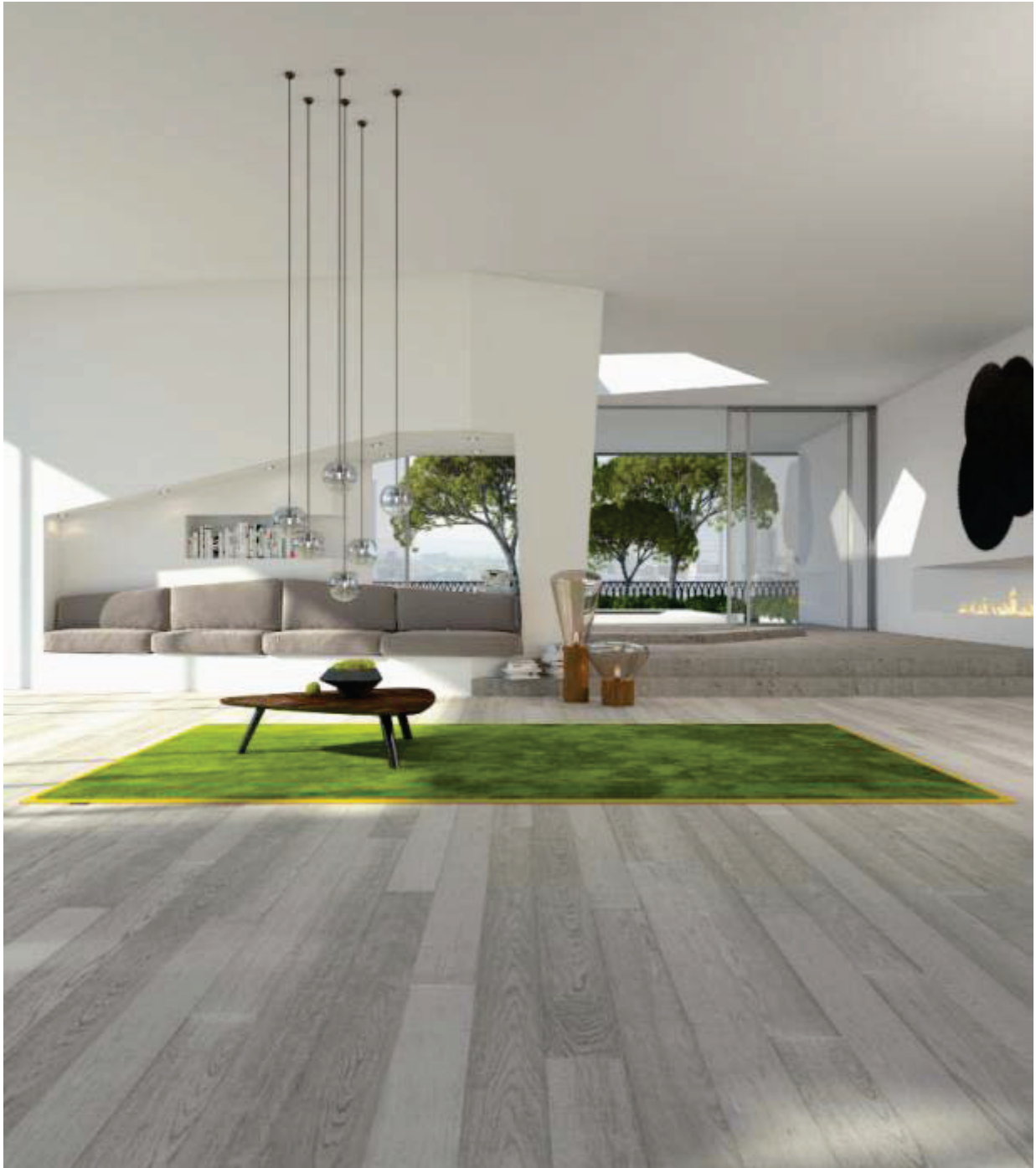
PURE SILK 2510, broad leather edge, rectangle, loft environment

OBJECT CARPET GmbH Rechbergstrasse 19 D-73770 Denkendorf