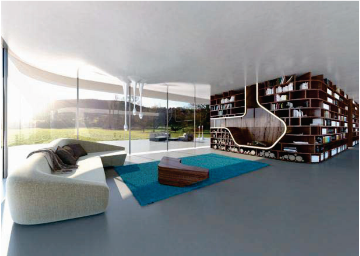
POODLE 1495, customised edge, rectangle in a loft environment designed by GRAFT Architekten Berlin