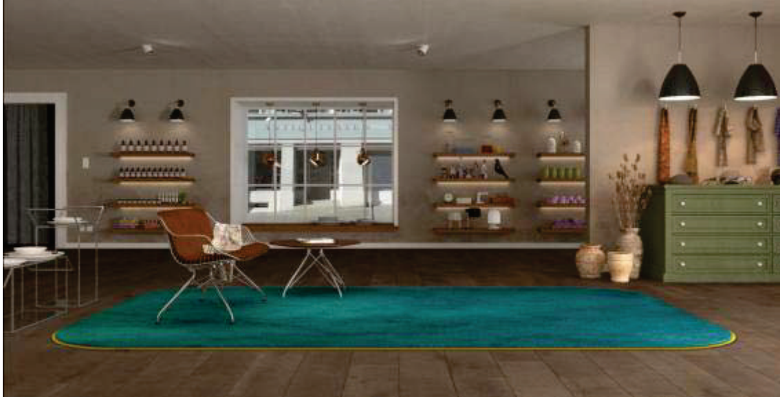
SILKY SEAL smaragd (emerald) 1232, thin leather edge, rounded rectangle, shop environment